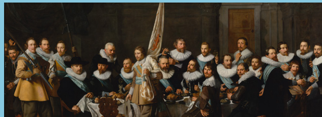
Nicolaes Pickenoy (1632)