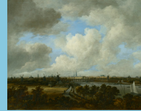
Jacob van Ruisdael (1680)