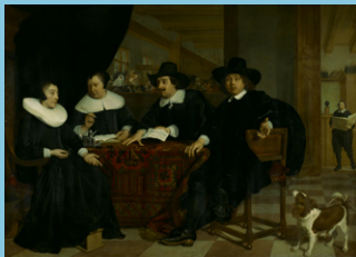
Bartholomeus van der Helst (1650)