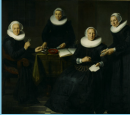
Dirck van Santvoort (1638)