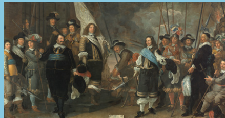
Govert Flinck (1648)