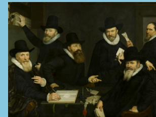
Cornelis van der Voort (1618)