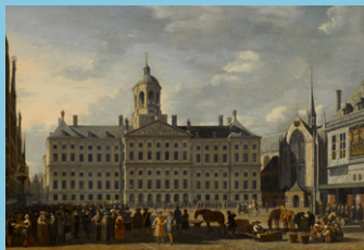
Gerrit Berckheyde (1673)