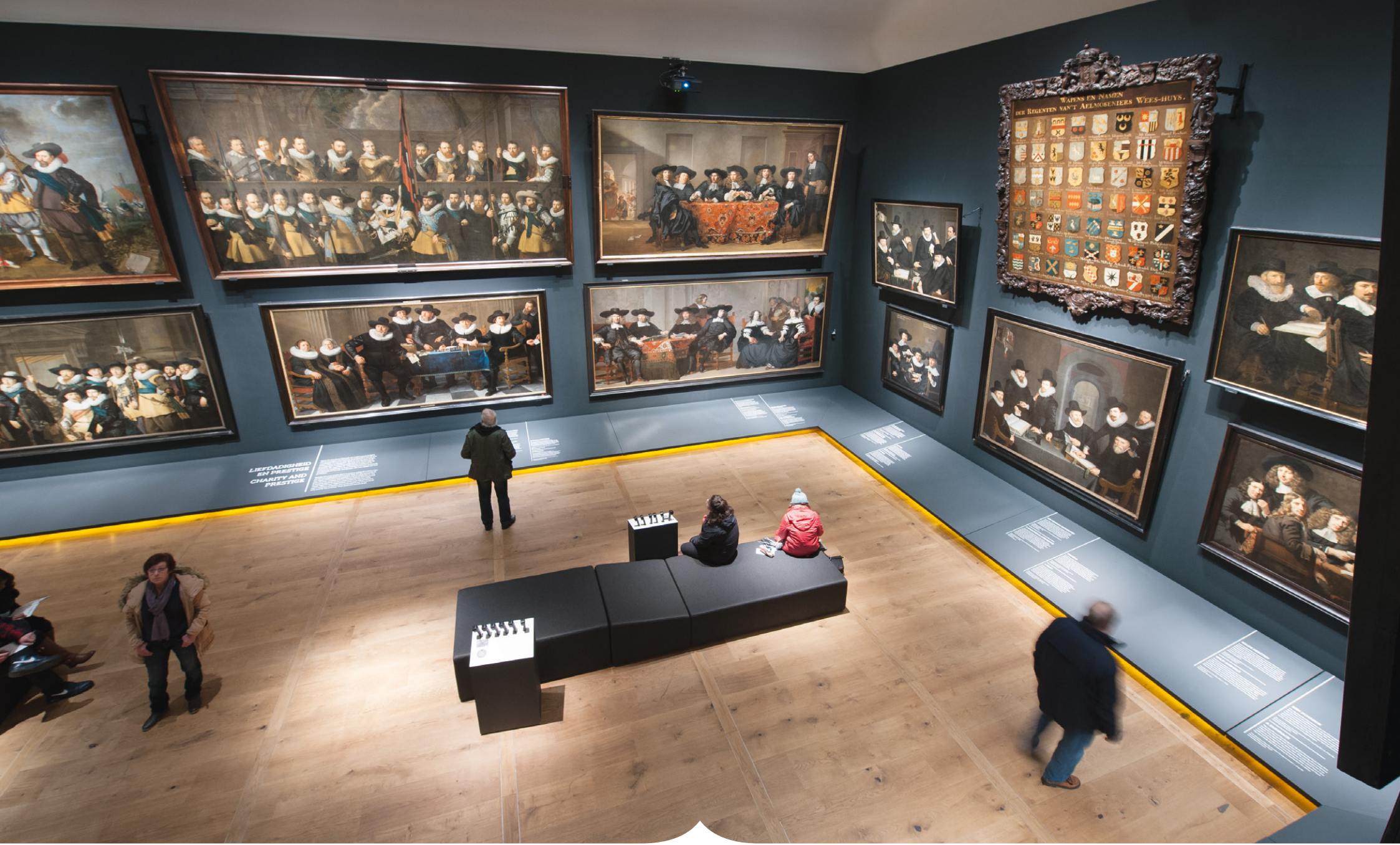
PORTRAIT GALLERY OF THE 17 TH CENTURY